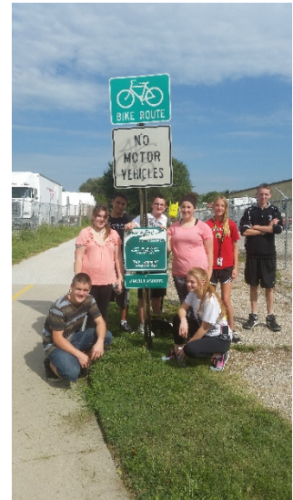
Members of the Lincoln AFJROTC unit taking care of our stretch of the Mahoney bike trail in Northeast Lincoln.