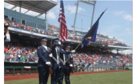
The Lincoln AFJROTC Color Guard presenting the Colors at the 2019 College World Series of Baseball in Omaha.